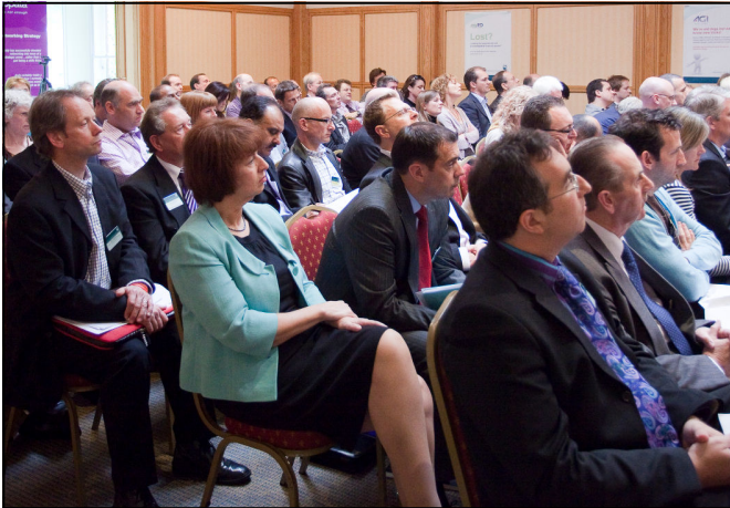
Delegates participating in the Network for Network South Regional Academy Conference.

The Academy for Chief Executives (ACE) is a leading provider of leadership coaching, mentoring and experiential learning.