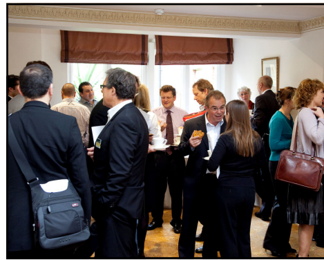
Delegates during break out sessions.