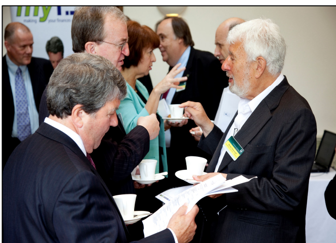
Delegates networking during break out sessions in The Persian Room which featured an exhibition highlighting suppliers' services and products.