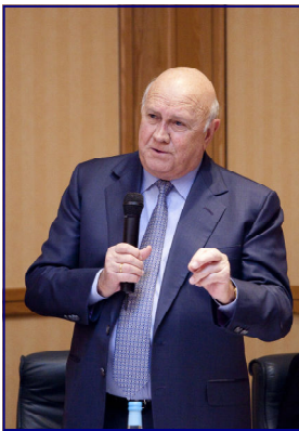
FW De Klerk addressing the ACE Regional Academy Conference at Warren House.