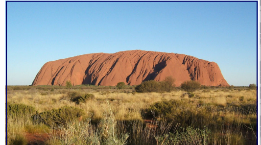
Uluru – Ayers Rock, the red heart of Australia.

are looking for. They spoke to us of romantic weekends away, Easter breaks with plenty of R&R and trips that include family fun over a Spring half-term break.