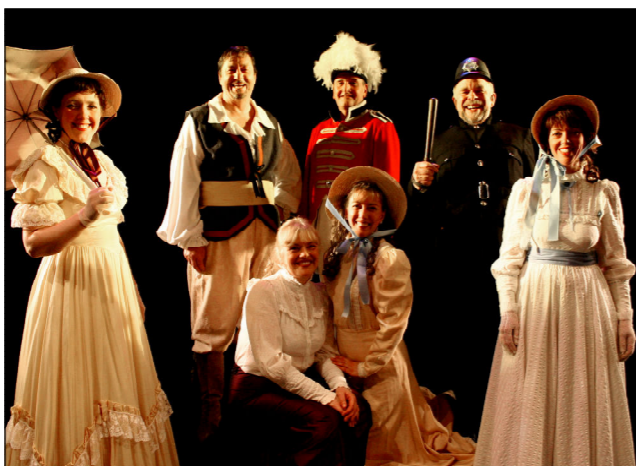
Cameo Opera in costume for The Pirates of Penzance .