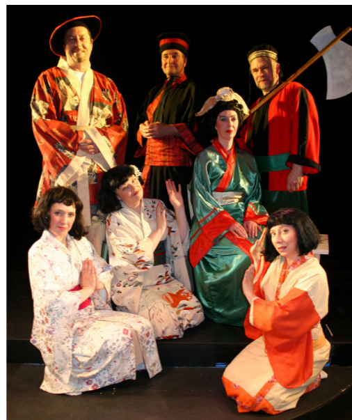
Cameo Opera performing The Mikado .

Cameo Opera was formed in 1990 and since then, the group has gained an enviable reputation for their intimate and innovative