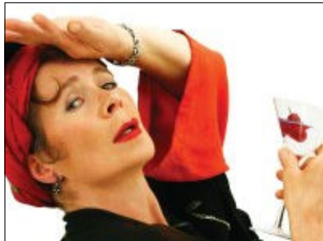
Celia Imrie as Judith Blis.

The show is set to be a sell out and Warren House is making it an extra special night. Join us for a pre theatre dinner. We have transport organised to and from the theatre and overnight accommodation is also available.