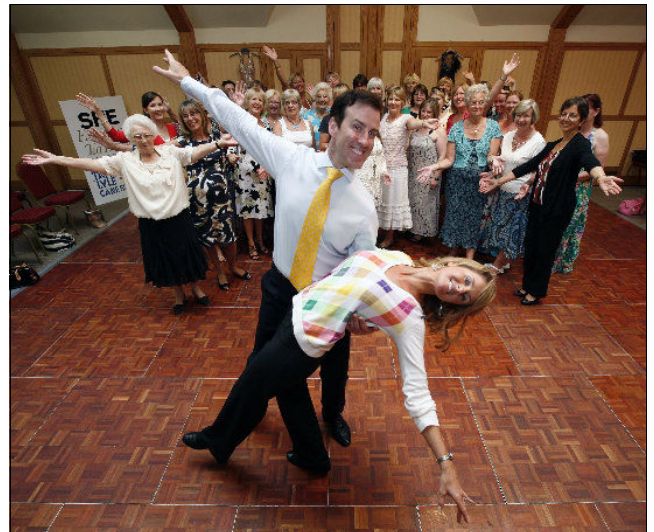
Erin Boag and Anton Du Beck with the She Experience guests following the masterclass at Warren House.

The She Experiences Tea Dance held on July 9th was another resounding success. It featured master patissier Eric Lanlard in the morning, followed by a buffet lunch served on the terraces overlooking the summer gardens and a masterclass dance session with Strictly stars Erin Boag and Anton Du Beck. Truly a great day.