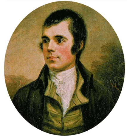
Robert Burns (1759—1796)