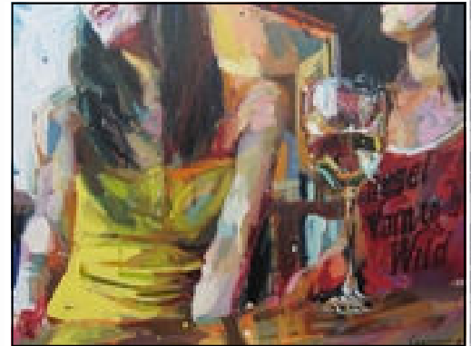
Art by Paul Lemmon, Wine & Art Evening.

Towards the end of September, Warren House, in association with Style Studio of Wimbledon, fashion and image consultants, hosted an exciting morning showcasing winter fashion and styling. Hot sharp exciting styles, fresh off the Italian catwalk, were modelled through the reception rooms and ballroom as the ladies present admired and discussed the designs.