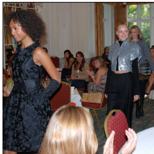
Fashion and Styling in the Ballroom.